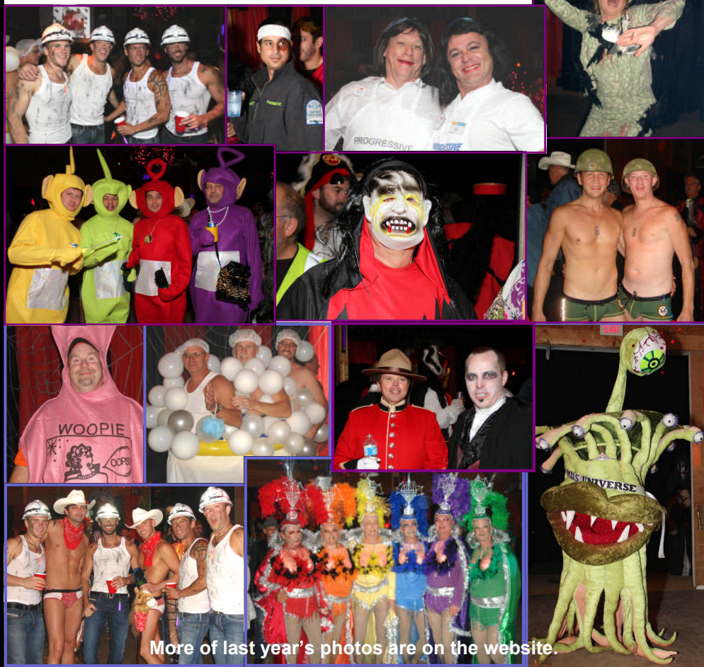
More of last year's photos are on the website.